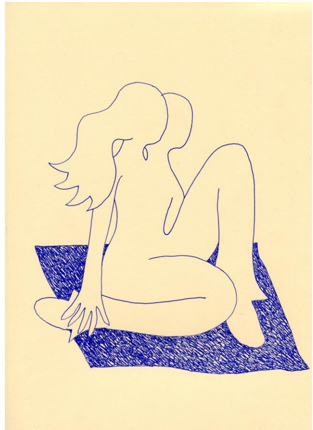
Dolores Ramona, This Is For You (image 4), 2020.