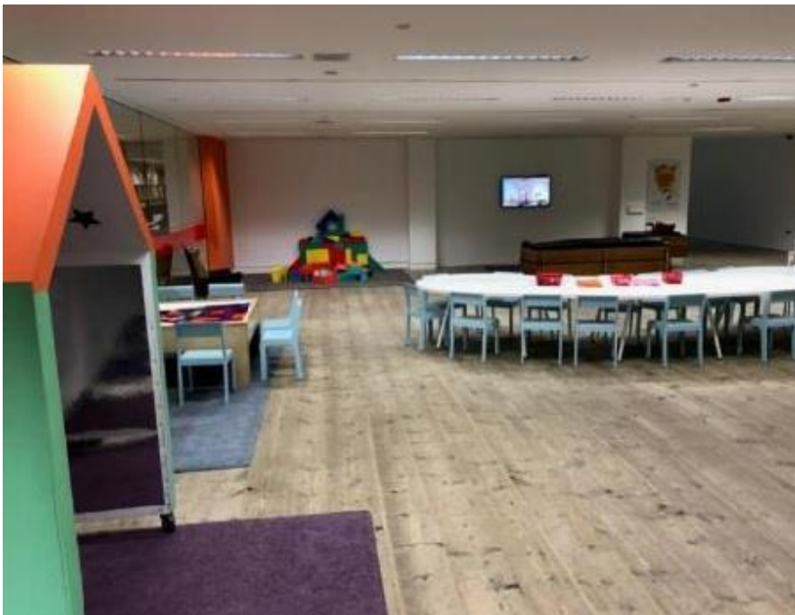
Image of Learning Lounge on Level 2, wooden floor, small rugs, small blue chairs and long table, and a miniature house with green wall and orange roof.