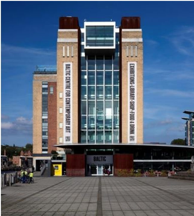
Image of BALTIC a converted flour mill, and its main entrance from an open paved Baltic square.