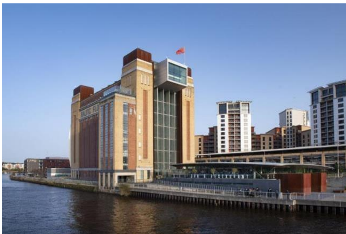
Image of BALTIC, a converted flour mill next to the River Tyne, with a blue sky.

E-mail info@balticmill.com Telephone 0191 478 1810 Website www.baltic.art