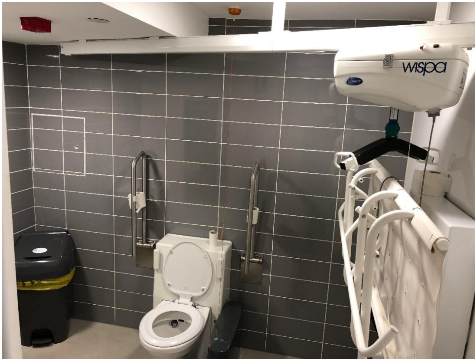
Image of ground floor access changing room with hoist and fold down bed, toilet with height adjustable sink

Specific toilet facilities are as follows: