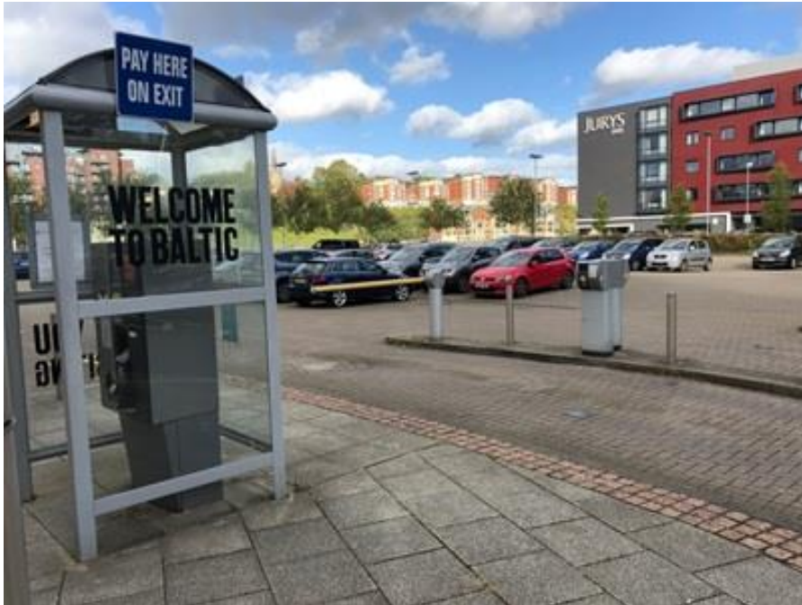
Image of road entering a carpark entrance, cars behind a barrier and paying station, with notices saying 'Pay here on exit' and 'Welcome to BALTIC'.

When travelling by car, follow the brown signs for Gateshead Quays.