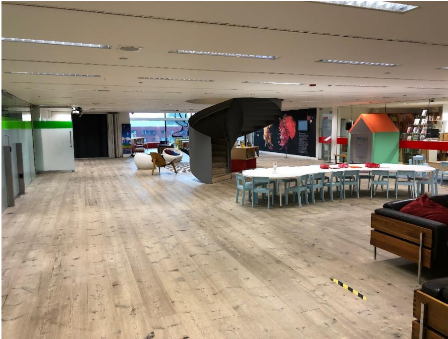
Image of Learning Lounge - wooden floor, tables and spiral staircase with metal casing around it.