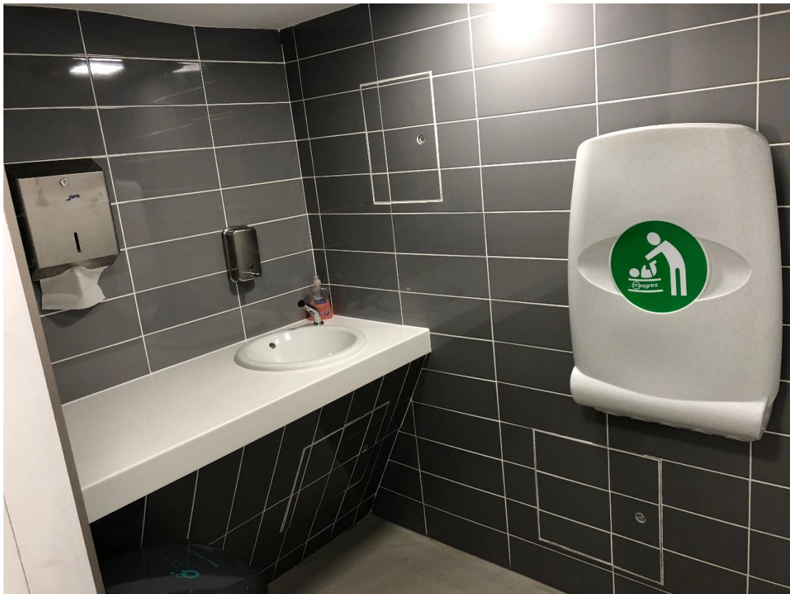
Image of ground floor baby change room, with sink and fold down baby change table.