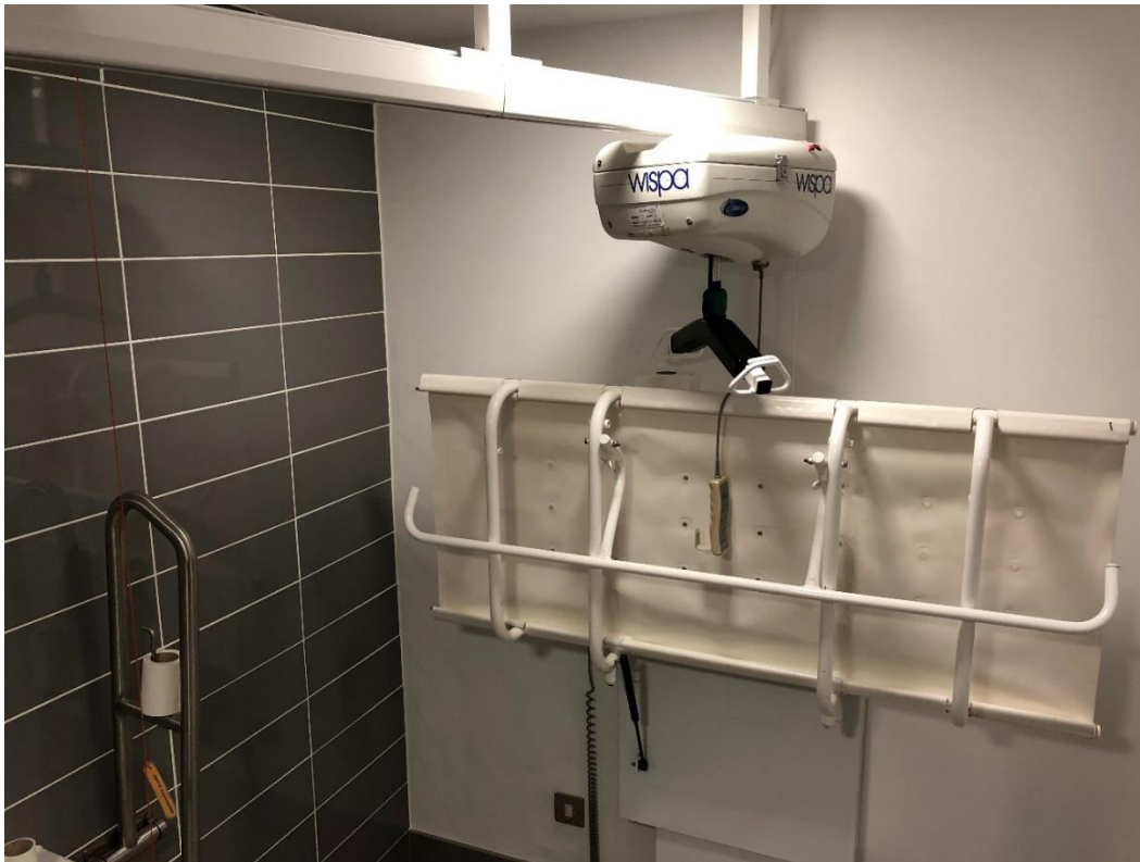
Image of ground floor access changing room with hoist and fold down bed, toilet with height adjustable sink