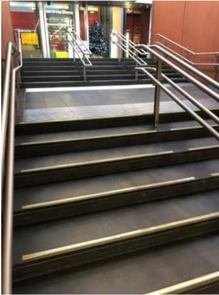
Image of steps from Hello Desk to lifts, with metal handles and white marking at the edge of each step.