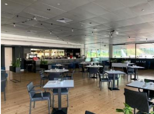
Image of Six Riverside, white square tables with great chairs spread out on a wooden floor. A bar is in the background.