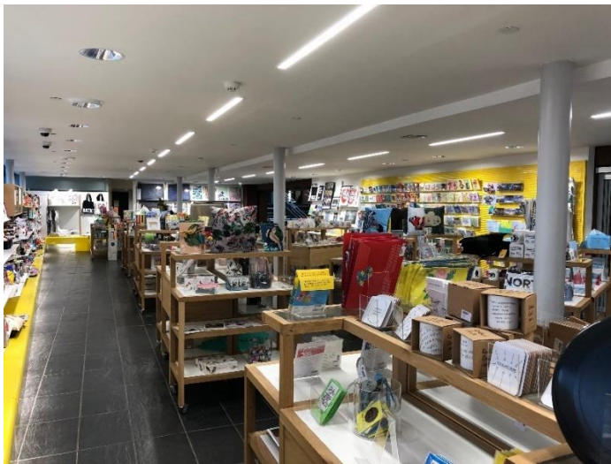
Image of BALTIC Shop, tables stacked with different products. Table closest with mugs and coasters.