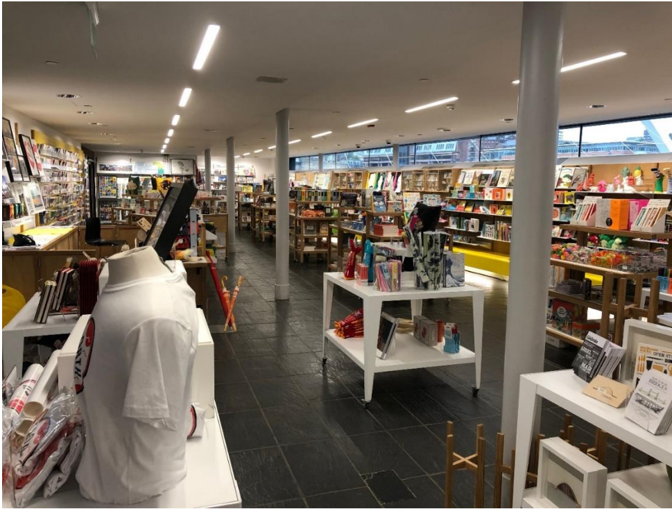
Image of BALTIC Shop, with tables and shelves full of items including books, arts & crafts. A mannequin torso models a white t-shirt with motif on the front.