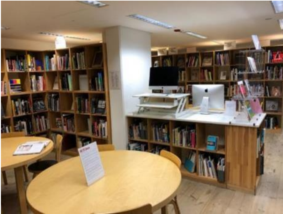
Image of BALTIC Library, circular wooden tables with chairs, large shelves with books and computer facilities.