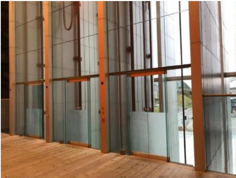
Image of 3 glass lifts, metal edges and see through glass panels that show the outside view including Baltic Square.