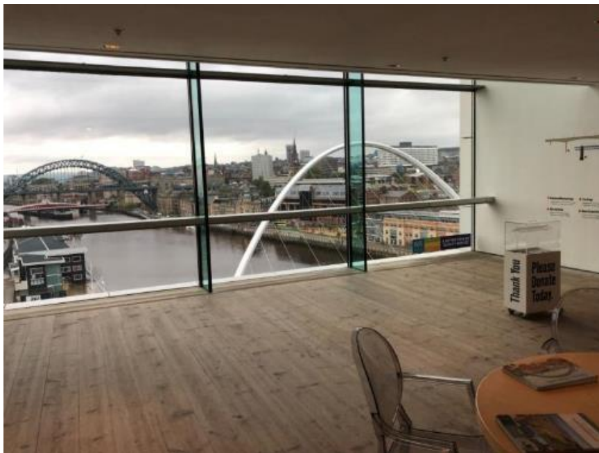
Image of Level 5 Viewing Box, wooden floor and three large window panels with horizontal metal bar across the front, displaying view of NewcastleGateshead, including Millennium and Tyne Bridge, River Tyne and skyline.