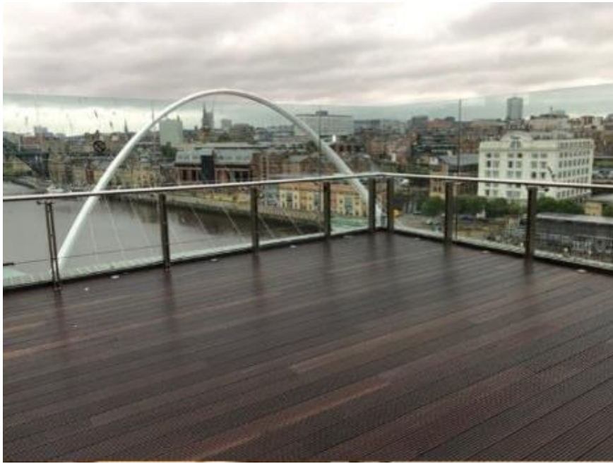
Image of Viewing Terrace on Level 4, dark wooden flooring, and transparent glass panels to show the local landscape including Millennium Bridge and River Tyne.