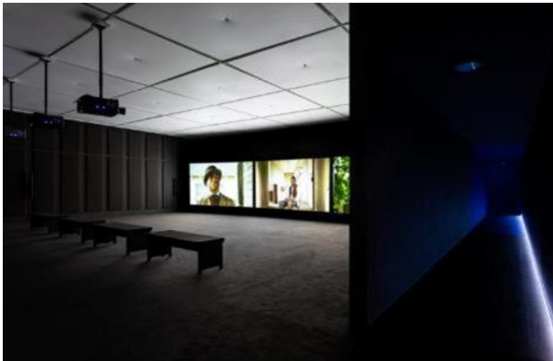
Image showing dark film screening, three screens showing a film lighting up benches in front of them. John Akomfrah, Precarity 2017 Ballasts of Memory installation view BALTIC Centre for Contemporary Art 2019