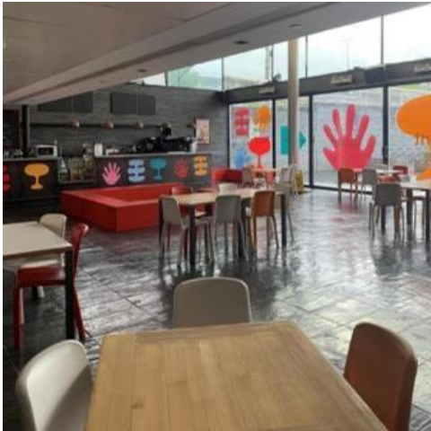
Image of BALTIC Front Room, rectangular wooden tables with plastic chairs spaced out on a slate floor. Large colourful shapes are in the background stuck on the windows and bar.